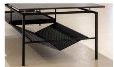
ref. 7002 - Metal tray (EP)