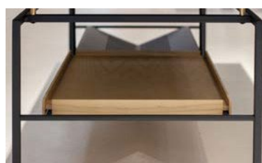
ref. 7001/7003 - Wooden tray (RO-W)